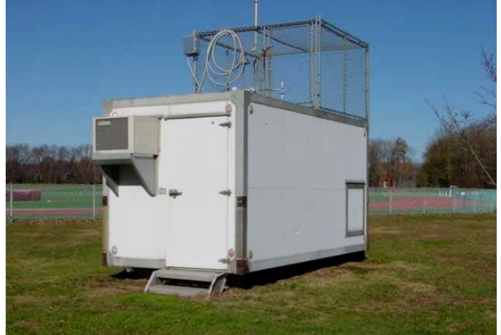
Figure 1: Ambient air monitoring trailer located at the Rider University site

Micro-scale (10 – 100m): Monitors that show significant concentration differences from as little as 10 meters or up to 50 meters away from the monitor are classified being Micro-scale monitors. This often occurs when monitors are located right next to low-level emission sources, such as busy roadways, construction sites, and facilities with short stacks.