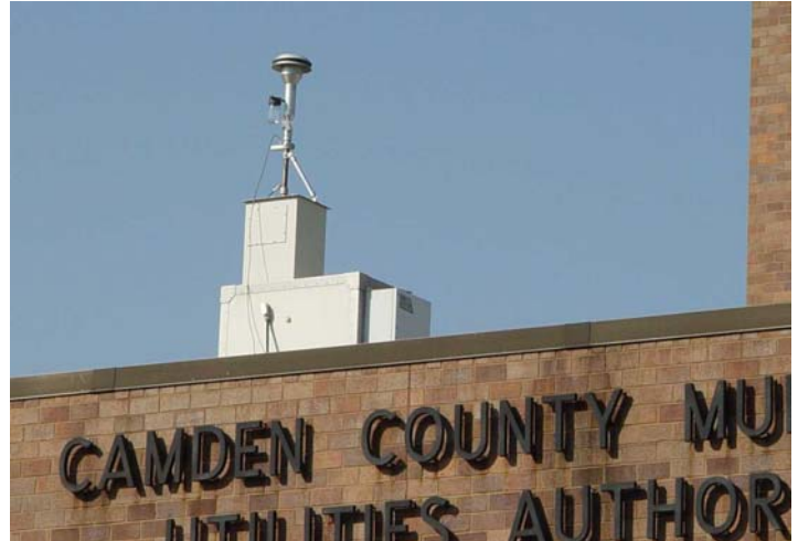
Figure 1: Ambient air monitoring sampler located on the roof of the Camden County Municipal Utilities Authority Building

Micro-scale (10 – 100m): Monitors that show significant concentration differences from as little as 10 meters or up to 50 meters away from the monitor are classified being Micro-scale monitors. This often occurs when monitors are located right next to low-level emission sources, such as busy roadways, construction sites, and facilities with short stacks.